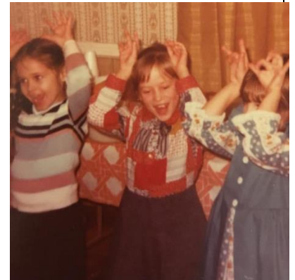
Yours truly in the middle, circa 1979, with my cousins singing Up on The Rooftop!

Our mom's side of the family would have an annual Christmas party on the second Saturday of December, taking turns on who would host. Over 25 family members sometimes shoved into a tiny house but we didn't care, people sitting on the floor and on the stairs, we had so much fun together! Games, Christmas music, opening presents, eating everyone's "best dish" they would bring every year. We cousins would go caroling in the neighborhood and if there was snow, end in a snowball fight boys vs girls. We haven't had a party in years, definitely something I want to bring back next year if possible.